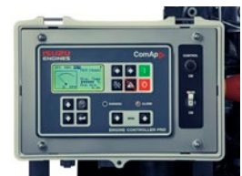
ComAp 'PRO' Controller

ComAp 'PRO' professional engine controller (advanced engine monitoring protection, plus customer application inputs/outputs, complete event history log, large easy to read display)