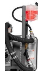
Heat Exchanger option