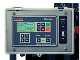
ComAp 'PRO' Controller