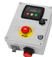
DeepSea 'ECO' Controller