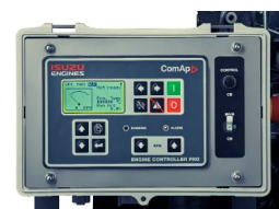
ComAp 'PRO' Controller