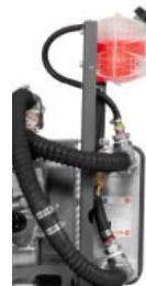
Heat Exchanger option