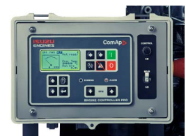
ComAp 'PRO' Controller