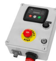
DeepSea 'ECO' Controller