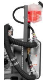
Heat Exchanger option